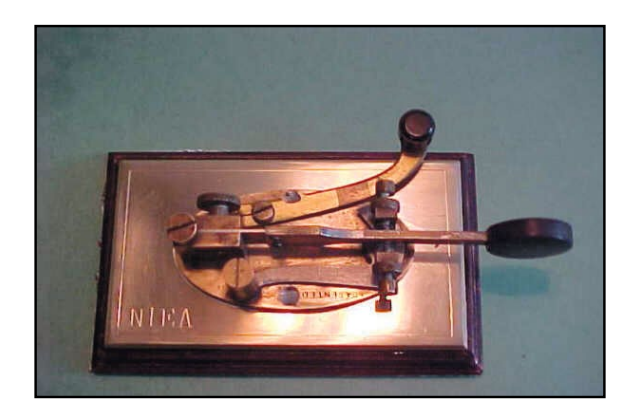
Figure 1. Bunnell DSK

got the sides mixed up at first, but keep on practicing, you'll get it finally.