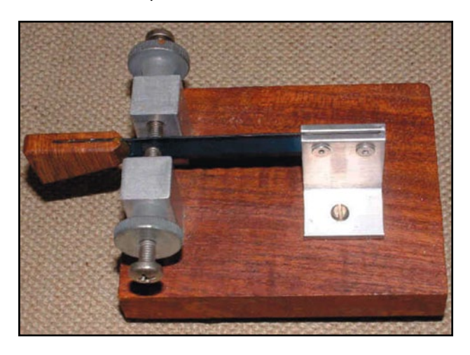
Figure 3. Sideswiper with hacksaw blade

Another way to make a sideswiper is with a hacksaw blade, as shown in Figure 3. Hacksaw blades are commonly used because they are both flexible and good conductors. Below is a sideswiper made with a hacksaw blade. Yours doesn't have to be quite so fancy. Just make sure to put a piece of electrical tape on the end for something to hold on to, and scrape the paint off the hacksaw blade so it makes good electrical contact with whatever you use for terminals.